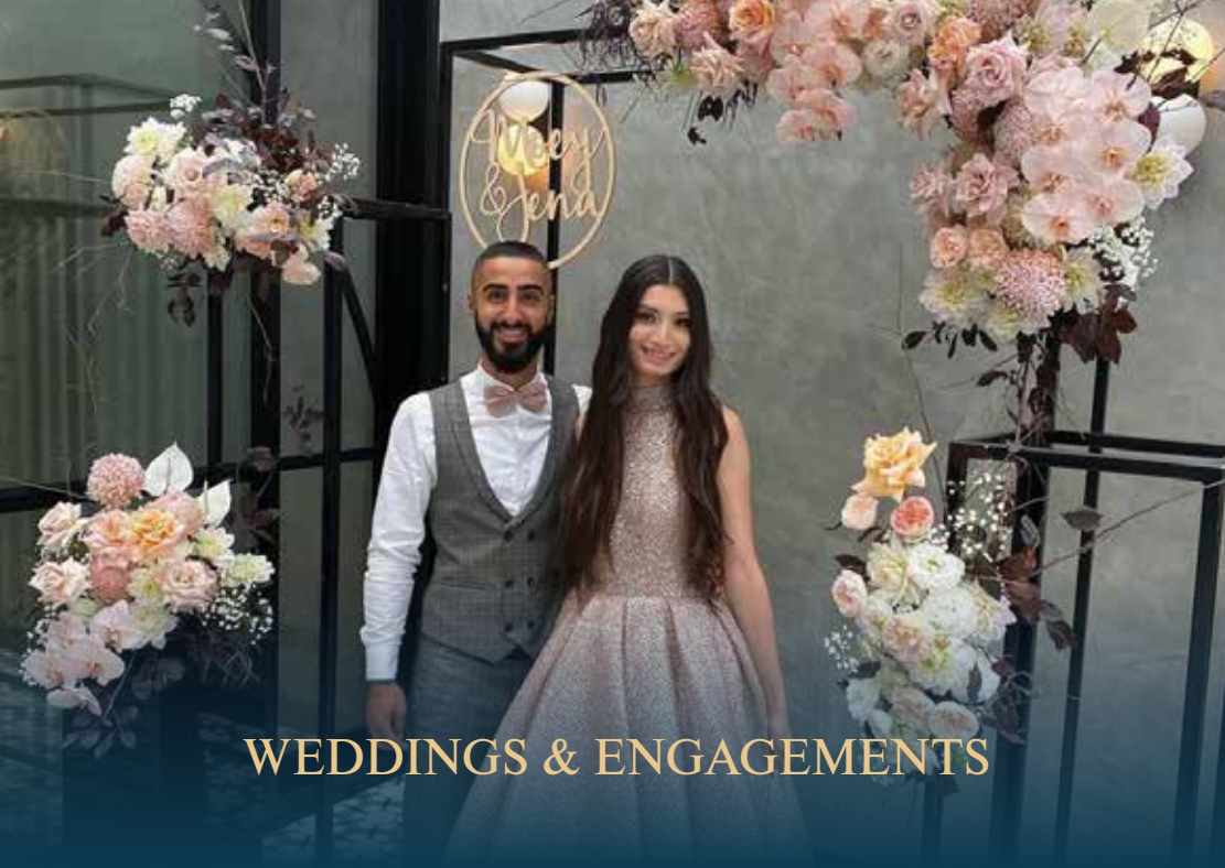
WEDDINGS & ENGAGEMENTS