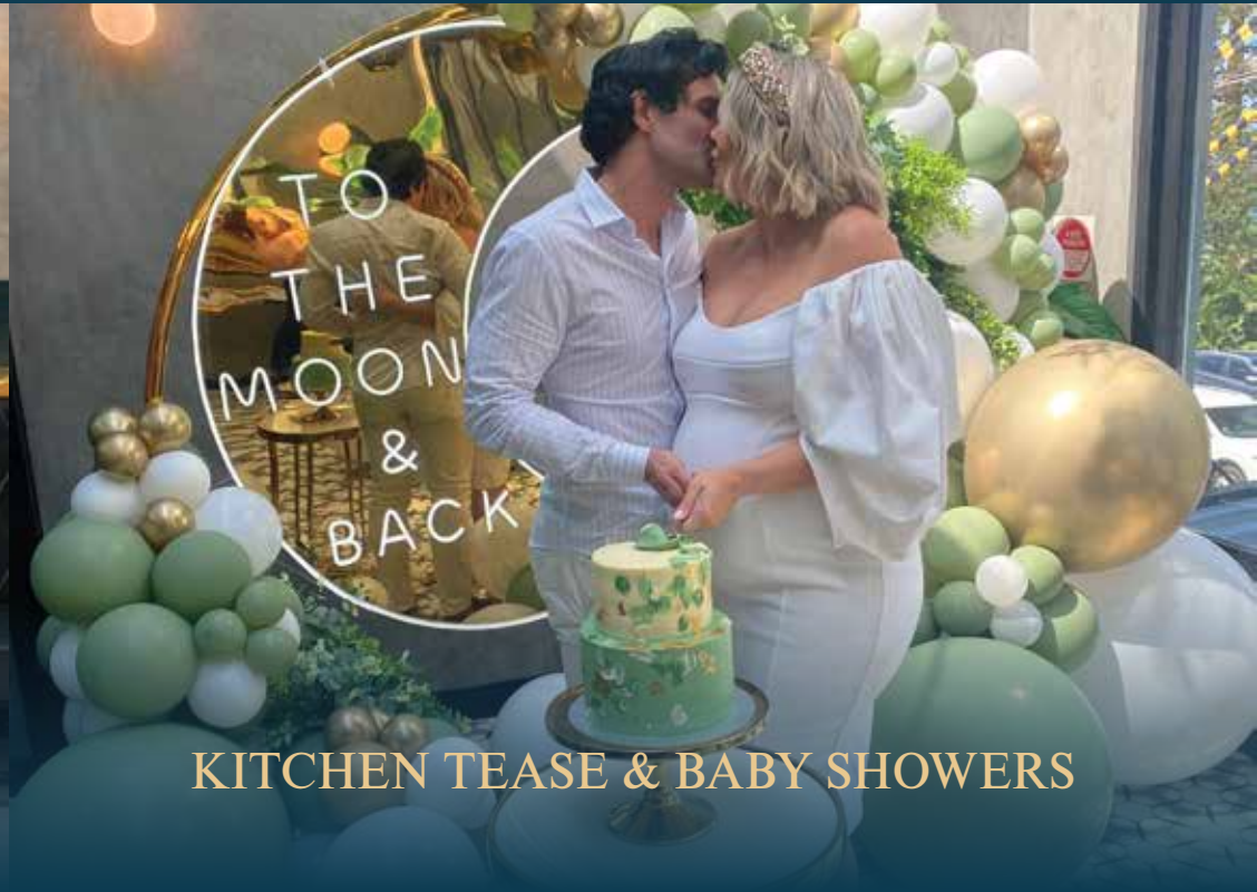
KITCHEN TEASE & BABY SHOWERS