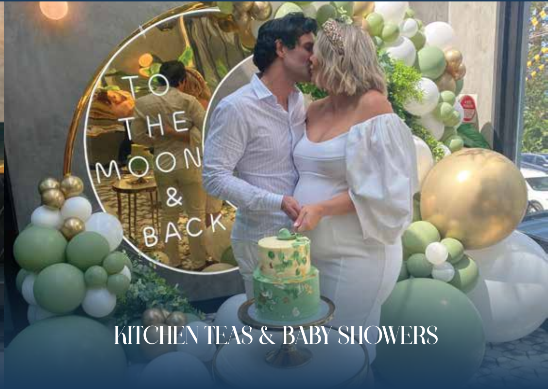
KITCHEN TEAS & BABY SHOWERS