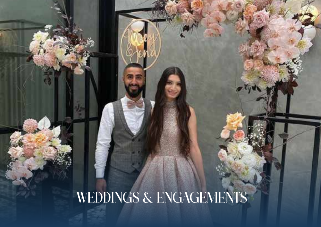
WEDDINGS & ENGAGEMENTS